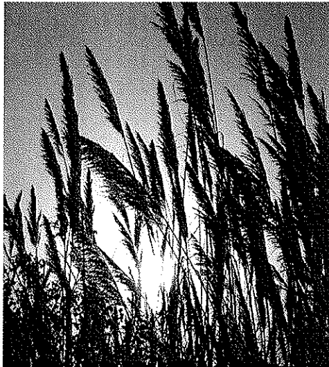
Wheatfield at sunset

"The Mass is a celebration of the Paschal mystery of Christ."